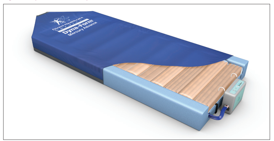
Figure 1. Dyna-Form Mercury Advance Mattress.