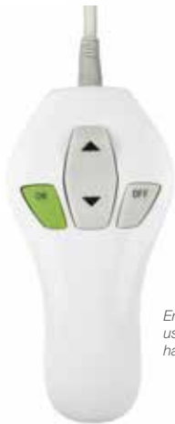
Ergonomic and user-friendly hand control

For professional and highly functional care environments with a harmonic and human atmosphere.