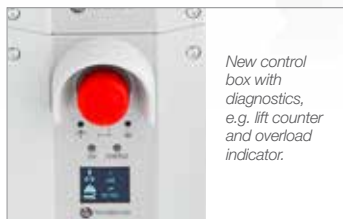
New control box with diagnostics, e.g. lift counter and overload indicator.