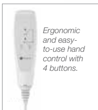
Ergonomic and easy-to-use hand control with 4 buttons.

A sound signal can be heard when the battery level is low and an indicator on the control box shows when charging is in progress.