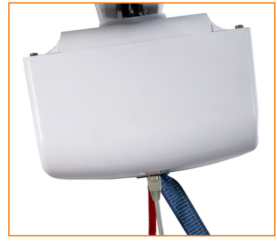
A-Series: No Tilt