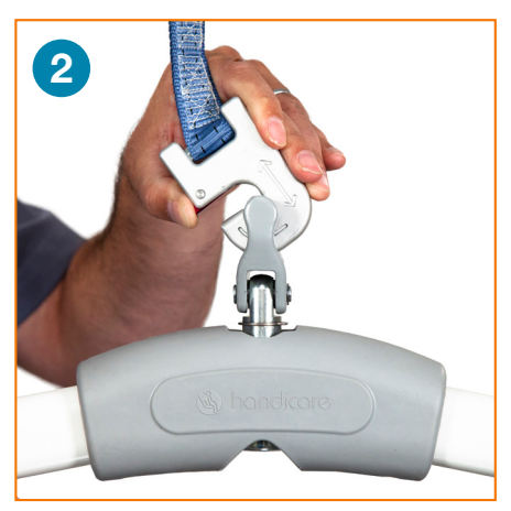
Slide red release switch upwards to release carry bar.