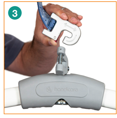
Swap carry bar and slide red release switch back down.