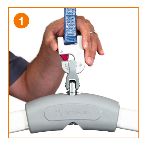
Hold carry bar and QRS hook