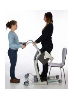
4. Place the Mover so the care recipient can easily place his or her feet on the step and his or her knees/ shins against the shin support. Let the care recipient take hold of the crossbars/handles however he or she wishes.