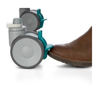
Release the brakes