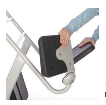
1. Fold up the two half-seats.

1. The steps shown below are for a transfer from one chair/wheelchair/bed/toilet to another, but it is done in the same way regardless of whether the movement/transfer is carried out from a chair, bed, wheelchair or toilet.