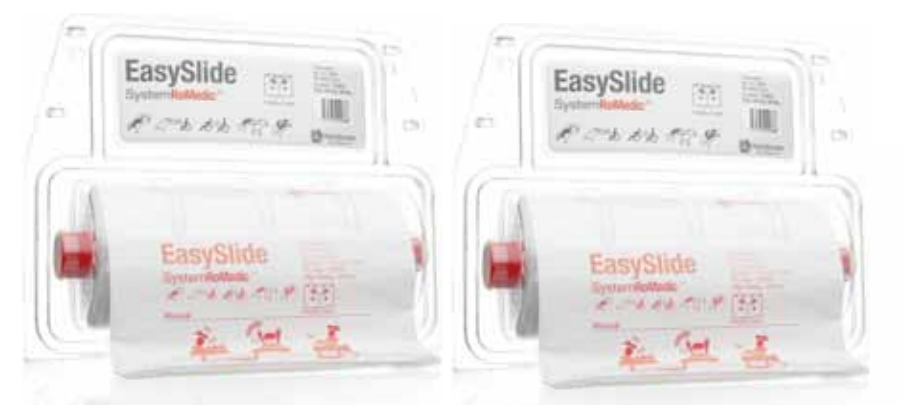
Sliding mats on a roll. Rolls come in packs of two, with up to 60 thin, pliable and easy-to-use sliding mats on each roll. Each roll comes in a practical and hygienic plastic dispenser pack that can be hung on the wall for safe, easily accessible storage.