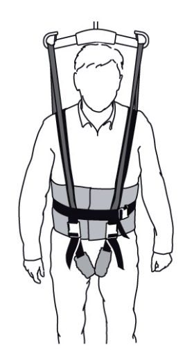
Max load: 300kg/660lbs

WalkingVest for gait training is easy for the caregiver to apply and it gives the patient a feeling of security. It is designed to provide support around the upper body and at the groin, via leg harness, during raising and gait training. WalkingVest is designed to activate the patient safely and comfortably.