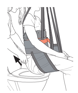
Pull the pants up as far as possible towards the groin. Place the leg support between the hollow of the knee and waistband.

Raise the patient and pull up the pants. Do not lift higher than necessary.