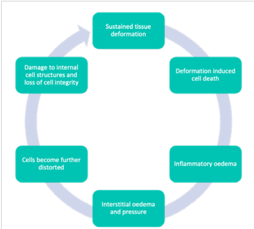
Figure 1. The tissue deformation "damage cascade"