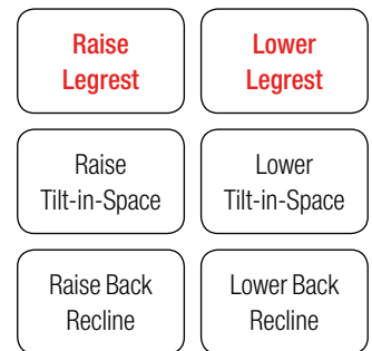
Encora Handset Button Configuration

Lower the legrest before returning the chair to its fully upright position to allow the user to stand up from the chair with ease.