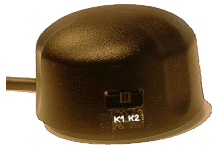
Left position CH1