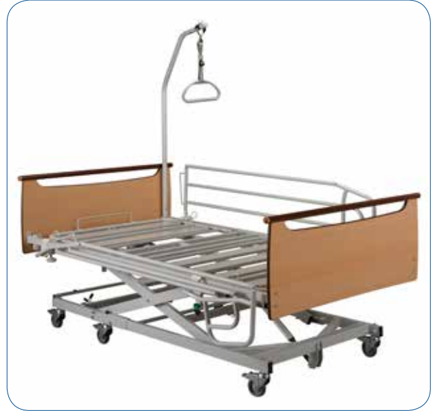
The XXL X'PRESS bed is available in 2 versions: 2 and 3 electric functions with folding.