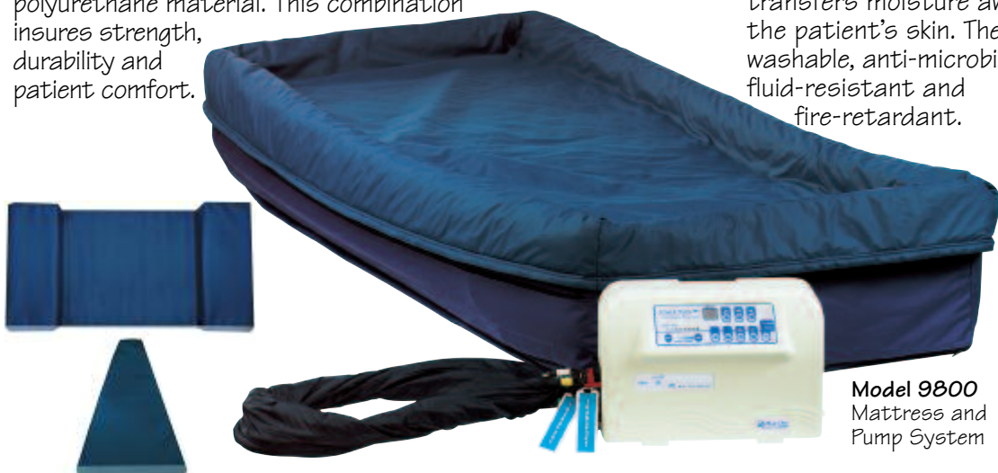
Model 9800 Mattress and Pump System

Vyvox - III® - Urethane coated, multi-stretch, moisture-resistant / vapor-permeable, low shear, quilted cover, transfers moisture away from the patient's skin. The cover is washable, anti-microbial, fluid-resistant and fire-retardant.