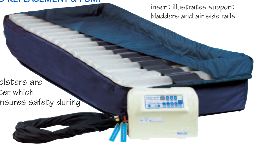
insert illustrates support bladders and air side rails

Mattress Cover: Vyvex-III® - Urethane coated, multi-stretch, low shear, moisture vapor permeable, quilted, removable, zippered cover, is anti-microbial and meets Cal. Tech. #117 for fire-retardancy.